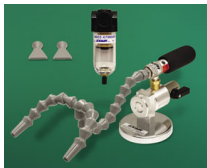
Model 3308 Mini Cooler System (two cold outlets)

Includes Mini Cooler, Single Point Hose Kit, Swivel Magnetic Base and Manual Drain Filter Separator with Mounting Bracket.