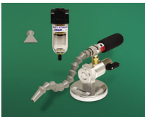
Model 3808 Mini Cooler System (one cold outlet)

Includes Mini Cooler, Single Point Hose Kit, Swivel Magnetic Base and Manual Drain Filter Separator with Mounting Bracket.