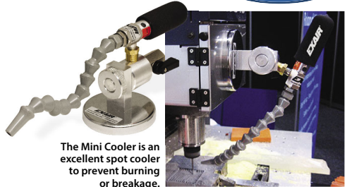
The Mini Cooler is an excellent spot cooler to prevent burning or breakage.