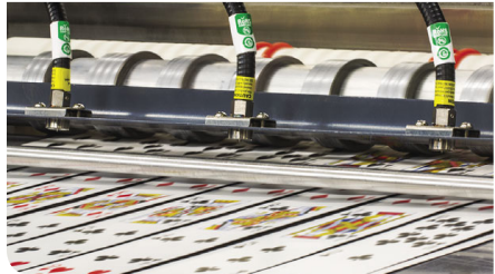
Gen4 Ionizing Points remove static from a card slitting operation.

The shockless Gen4 Ionizing Point delivers a high concentration of positive and negative ions for fast static decay. It can neutralize any surface within 2" (51mm).