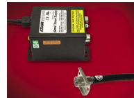
The Model 8299 Gen4 Ionizing Point System includes the Gen4 Ionizing Point and Model 7960 Gen4 Power Supply.